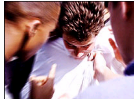
Prime Minister John Howard has announced new powers for teachers

An Australian teenager has won record damages after a court found that his school "grossly failed" in its duty to protect him from a school bully.